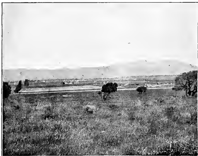
GENERAL VIEW OF FORT ROMIE.